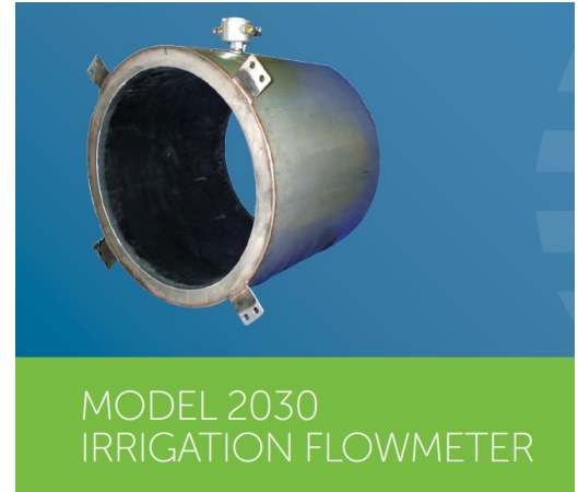
MODEL 2030 IRRIGATION FLOWMETER

The Meters are suitable for Pit or Insert Mount into a wide variety of installations often with minimal impact on existing infrastructure.